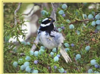
7/22/23 Check out the GVAS Photo Gallery here.

Whether you're an experienced birder, or just want to learn more about the amazing wildlife and important habitats in the Grand Valley and Mesa County, we're glad you stopped by!