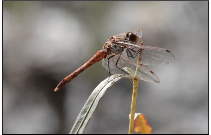
Variegated Meadowhawk

These findings help the Grand Valley Audubon Society board make sound decisions when managing critical wetlands habitat in the Nature Preserve that benefit all native species.