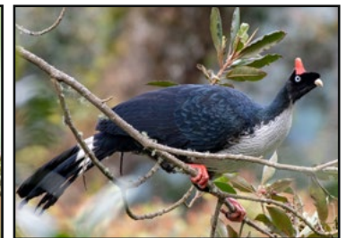
Only forty pairs of Orange-breasted Falcons survive in Central America (top). Pink-headed Warbler (L) A Horned Guan (R). All three are threatened by deforestation. Ebird images.