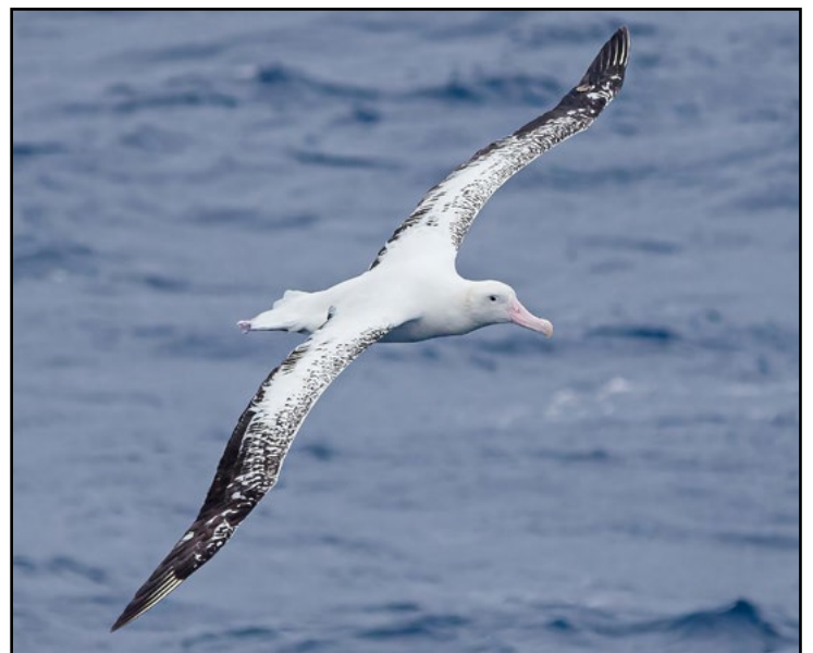
Tristan Albatross. Of the 22 species of albatrosses, 21 are listed as having some level of population concern, including two that are critically endangered: Tristan Albatross and Waved Albatross.